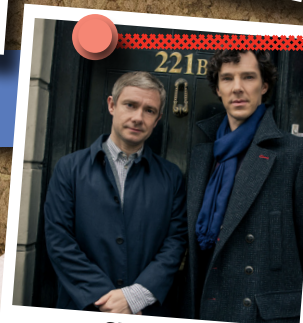
Sherlock Fridays at 7:00 p.m. June 19 - July 17