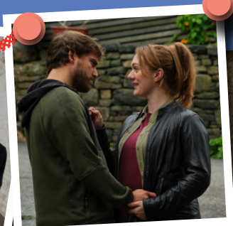
Ridley Wednesdays at 9:00 p.m. June 17 - September 16