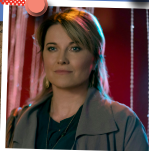
My Life is Murder Tuesdays at 9:00 p.m. June 16 - July 21