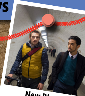
New Blood Wednesdays at 8:00 p.m. June 17 - July 15