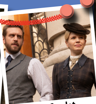
Miss Scarlet and the Duke Mondays at 8:00 & 9:00 p.m. June 15 - September 21