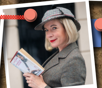
Lucy Worsley's Holmes vs. Doyle Fridays at 9:00 p.m. June 19 - July 3