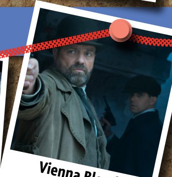
Vienna Blood Thursdays at 8:00 p.m. June 18 - September 17