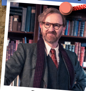
Bookish Thursdays at 7:00 p.m. June 18 - July 23