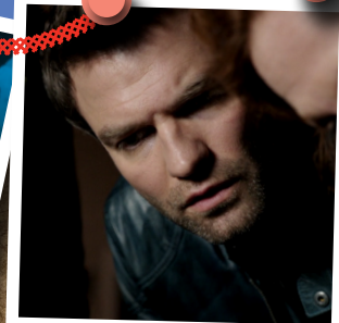
Murder in the Mountains Thursdays at 9:00 p.m. June 18 - August 27