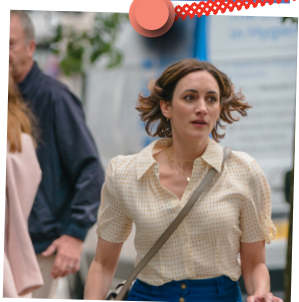
The Marlowe Mystery Club on Masterpiece Tuesdays at 7:00 p.m. June 16 - July 21