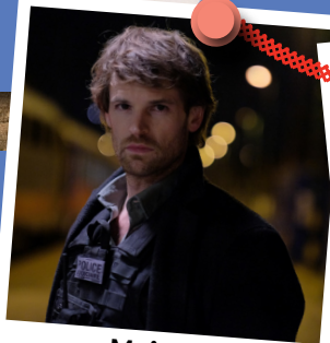
Maigret Mondays at 7:00 p.m. June 15 - July 6

Watch Emerge 6.3 on the PBS App or at pbs.org/livestream