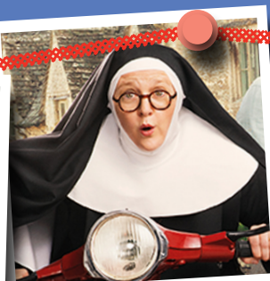
Sister Boniface Mysteries Tuesdays at 8:00 p.m. June 16 - September 29