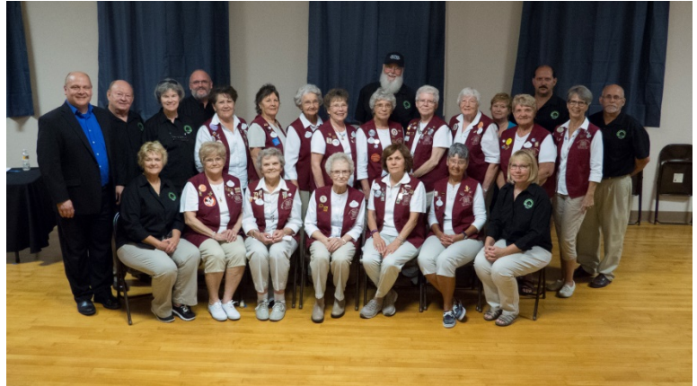
Volunteers with the Walt Disney Hometown Museum in Marceline, MO played host to the KMOS community screening of American Experience: Walt Disney

We cultivate UCM students' professional development and encourage creative exploration through a multi-disciplinary learning lab that supports the classroom environment.