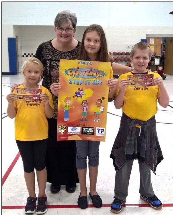
Students from Dresden (Pettis County R-XII) wrote notes of appreciation (above) and pose with their principal.