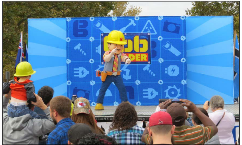
Inspiring youngsters to accomplish any task at hand, Bob the Builder performs for residents of Jefferson City and other attendees of the annual Multicultural Festival.

We cultivate UCM students' professional development and encourage creative exploration through a multi-disciplinary learning lab that supports the classroom environment.