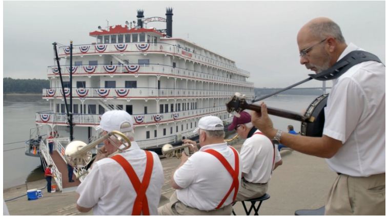
The Paddlewheeler America is serenaded by a local Dixieland band while docked at the Mississippi River landing in Cape Girardeau, one of many communities featured in the third season of Missouri Life.

We cultivate UCM students' professional development and encourage creative exploration through a multi-disciplinary learning lab that supports the classroom environment.