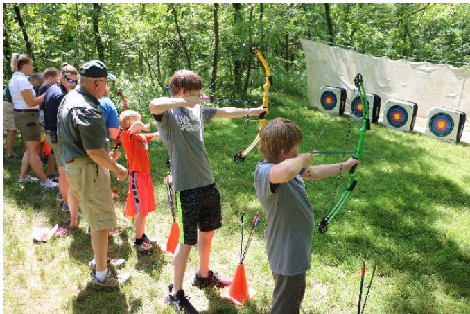
MDC staff provided instruction and safety lessons in archery.