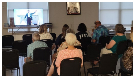
Community screening of "Ali."

AUGUST 2021: As many of our communities were still in the midst of the COVID-19 Pandemic, KMOS engaged our communities by hosting virtual screenings of PBS KIDS programs each month titled Third Thursdays. During these virtual events, participants were able to receive a special KMOS PBS Curiosity Kit for attending.