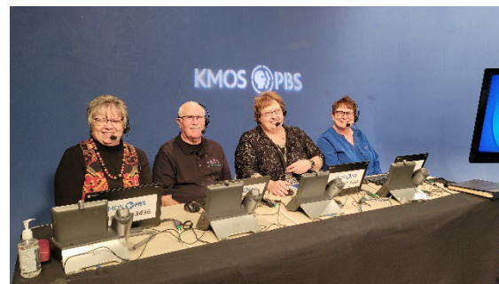
WILS volunteers take calls from KMOS donors.

February 2020 – April 2022: KMOS PBS continued to host Indie Lens Pop-Up film screenings in Jefferson City along with monthly virtual 'Third Thursday' PBS Kids programs.