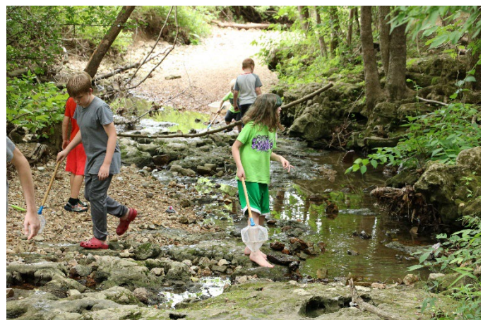
Searching the creek for aquatic residents.

With this community event, KMOS-TV continued its mission of working with our partners to promote the great people, places and resources that make central Missouri such an amazing place to live, work, learn and play and provided the local area with an educational outlet that sought to engage and educate area youth and families about nature, area wildlife, and outdoor recreation.